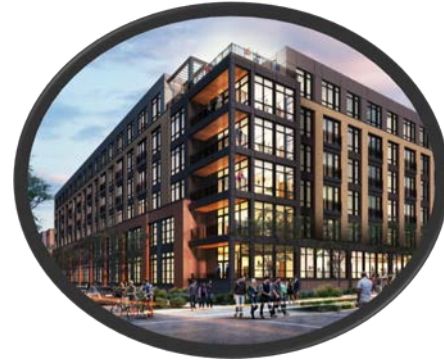
Royal Street Bus Garage