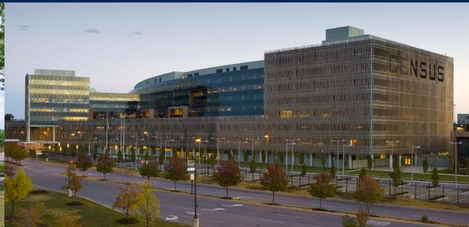
The Census Bureau