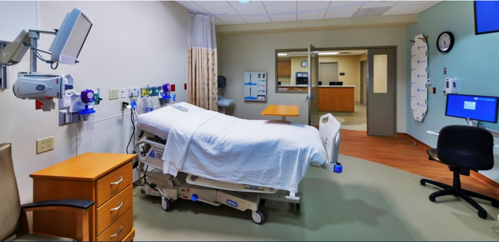
George Washington University Hospital