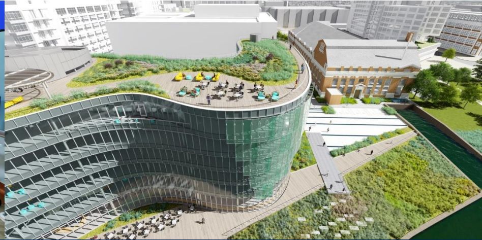
DC Water Headquarters