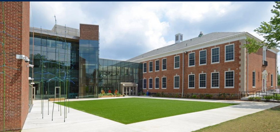
Horace Mann Elementary School