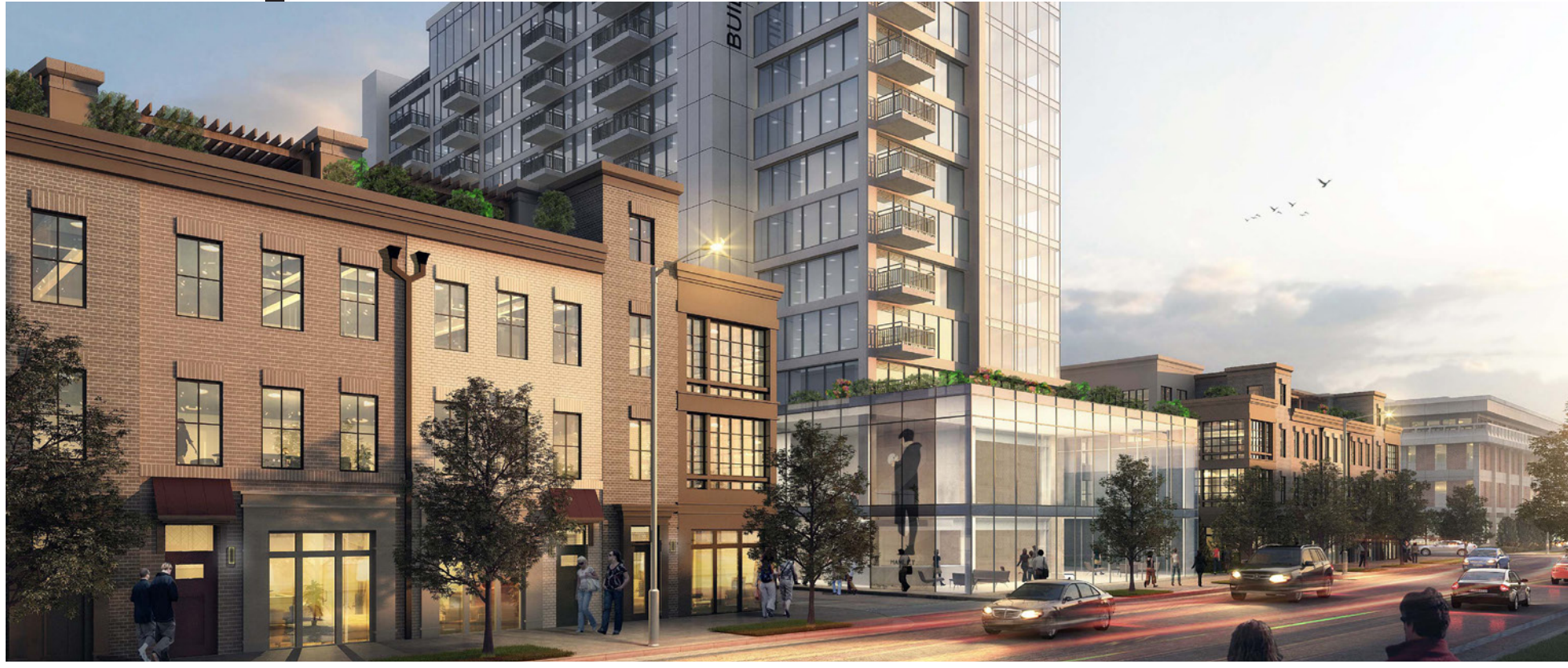
901 N FAIRFAX STREET (CROWNE PLAZA HOTEL)