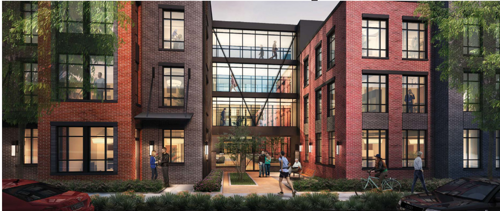
600 N ROYAL STREET (FORMER WMATA BUS GARAGE)