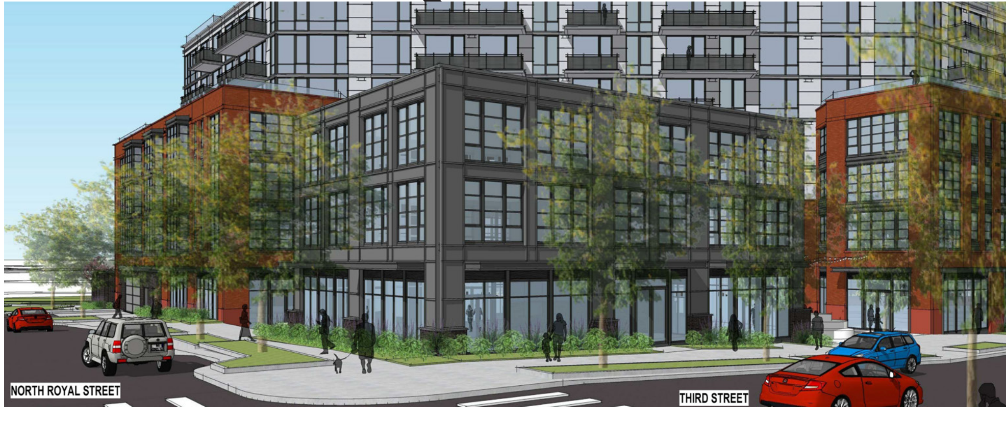
1201 N ROYAL STREET